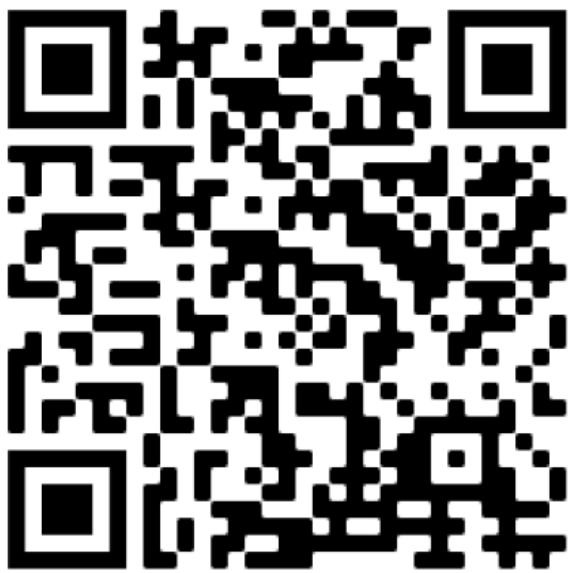
SCAN TO LEARN MORE ON OUR WEBSITE!