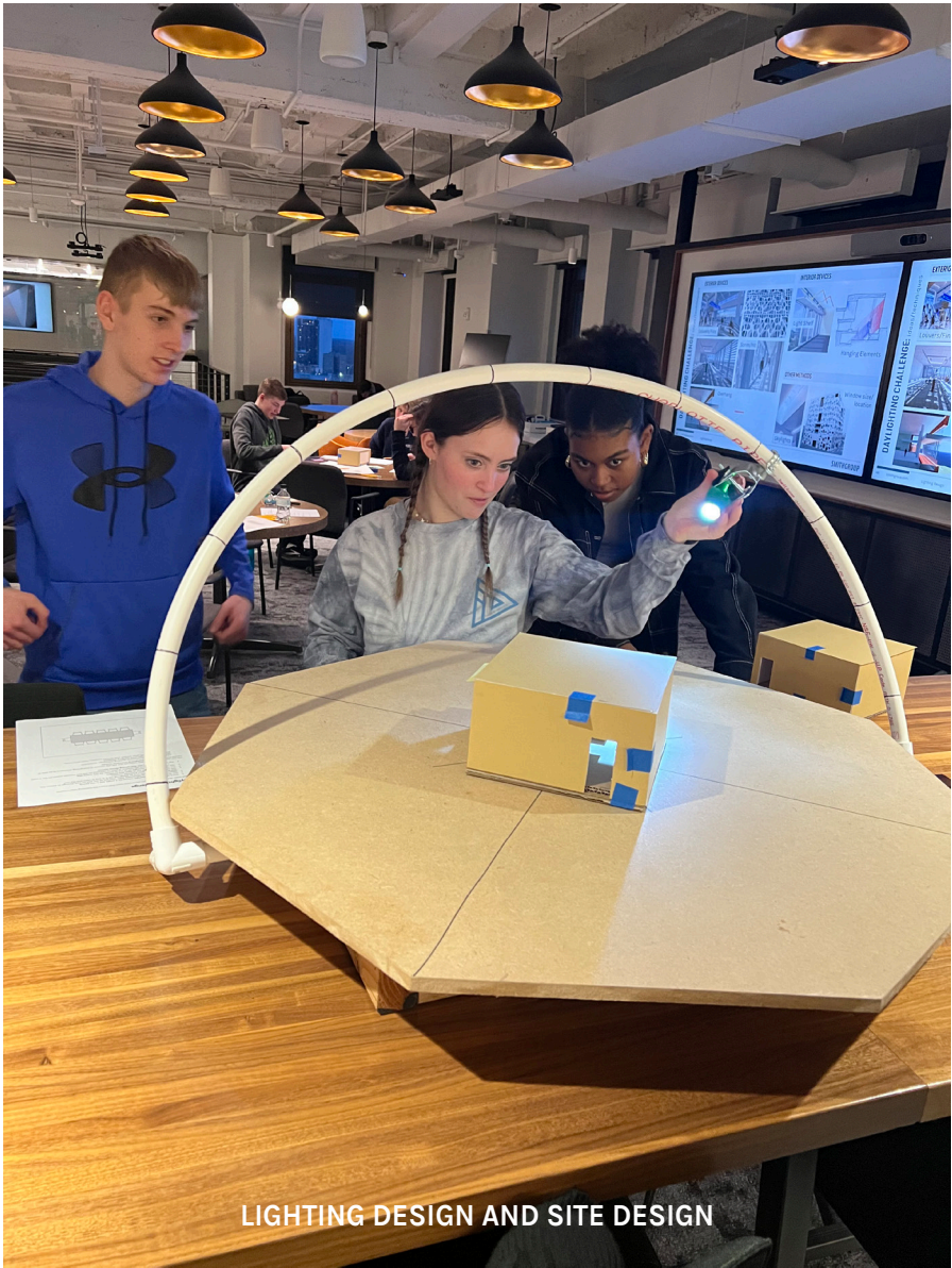
LIGHTING DESIGN AND SITE DESIGN