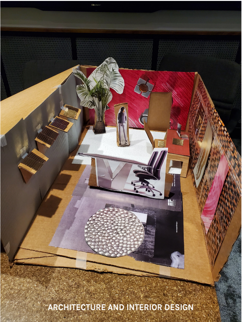
ARCHITECTURE AND INTERIOR DESIGN

TUES. 4/23. 6-7:30PM - STRUCTURAL ENGINEERING