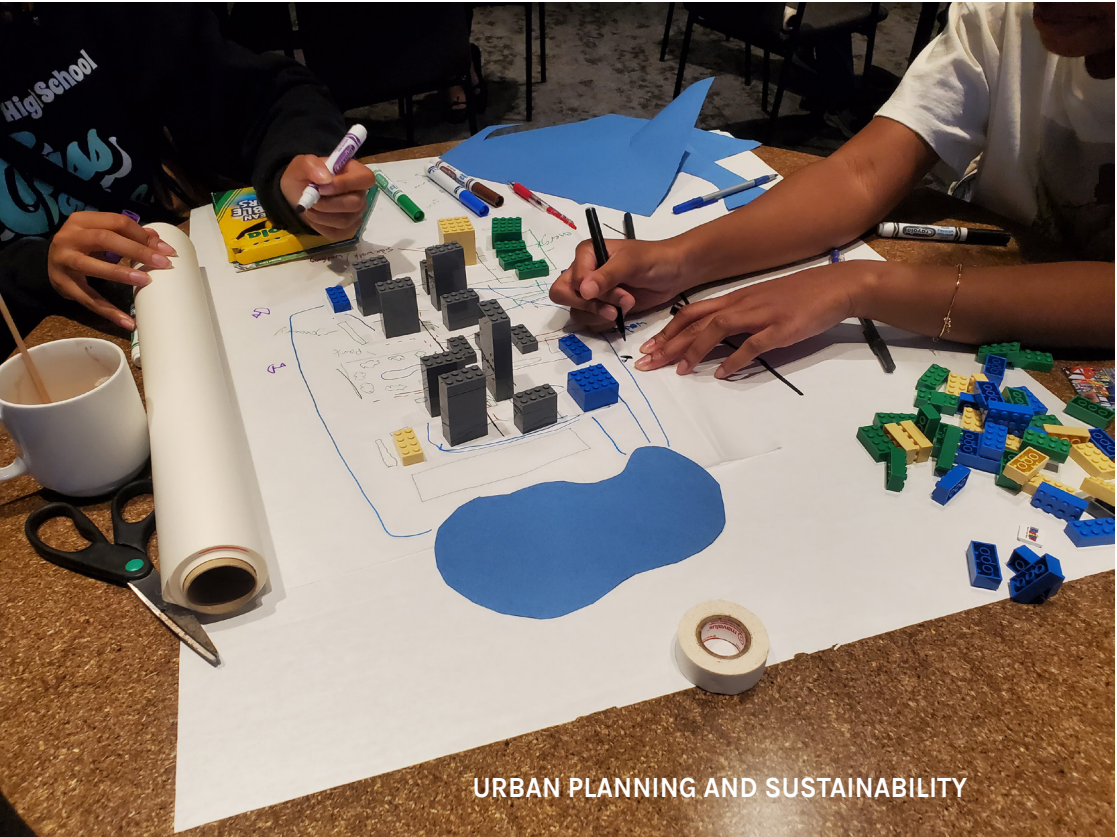
URBAN PLANNING AND SUSTAINABILITY